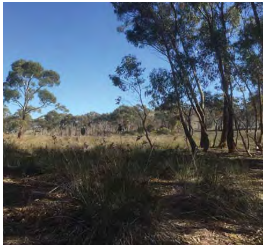
Mallee and Grey Box at Nardoo Hills Reserve, the eucalypts being protected by Dahl Trust funded firebreaks.