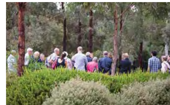
Guests during National Eucalypt Day 2015 celebrations enjoy the eucalypt walk at the Australian Garden, Cranbourne.