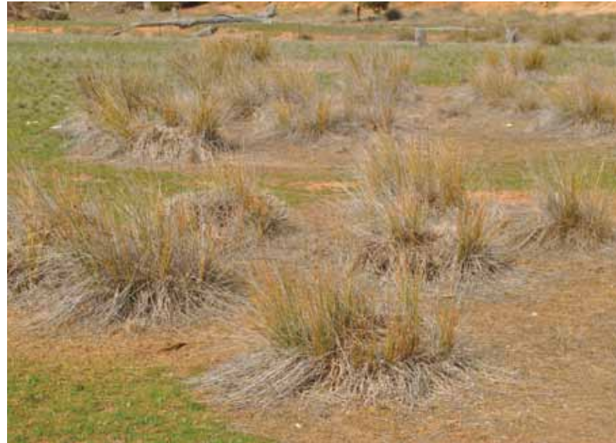
Spiny rush (Juncus acutus) after herbicide application at Nardoo Hills Reserve, Central Victoria

Spiny rush control was also funded but application of herbicide had to wait until sufficient soil moisture to facilitate herbicide uptake. Spiny Rush has now been sprayed. The dry conditions have also delayed native flora seed being sown in the erosion site as this needs to occur post-Spiny Rush control.