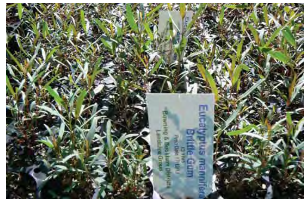
Brittle Gum propagation by the Bowning and Brookham Districts Landcare Group.