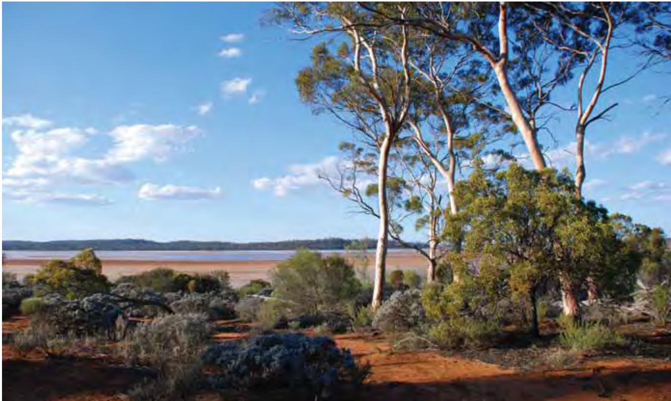
The Great Western woodlands of the tropical savanna and salt lakes of Western Australia.

More information on this project and links to the full and summary reports are available at www.kimberleytocape.net.au/eucalypts-of-northern-australia .