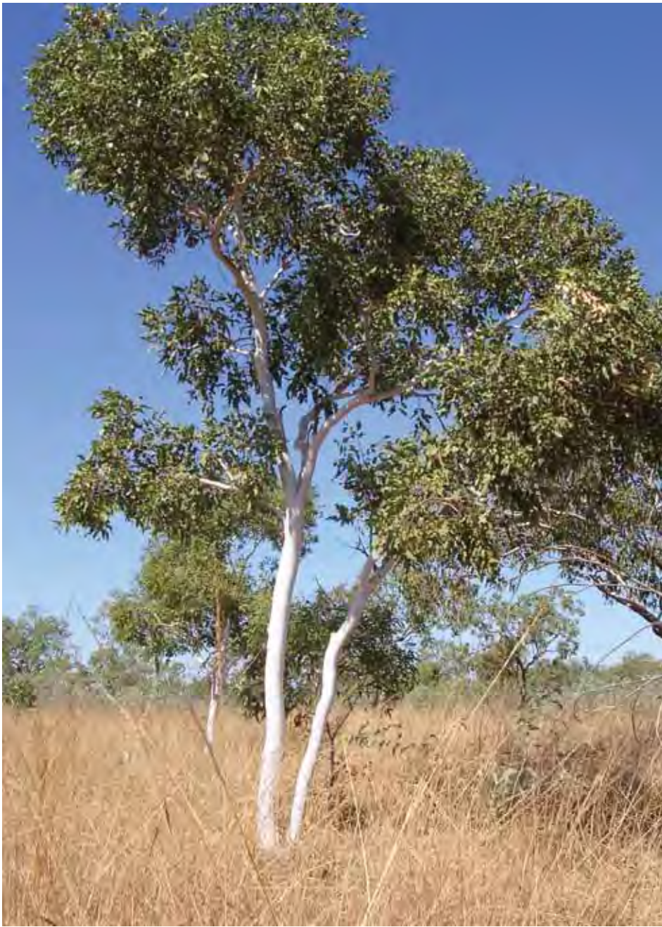
Ghost gum ( Corymbia flavescent ) otherwise known as Walarri or Jarlpari by the Walmajarri and Gooniyandi people is used for making ngurti (collamon) and jara (shields). This is one of many eucalypts described in the booklet ‘Manawarnti – all the trees’.

The booklet highlighted the artwork that local artists make from and about eucalypts. It included the names of the trees in two local languages – Walmajarri and Gooniyandi and highlights the traditional uses of eucalypt products. Project partners included: Ngurra Arts staff and artists; Walmajarri and Gooniyandi language specialists; Yiriman Project / Kimberley Aboriginal Law and Culture Centre; Marninwarntikura Womens’ Resource Centre; and Environs Kimberley.