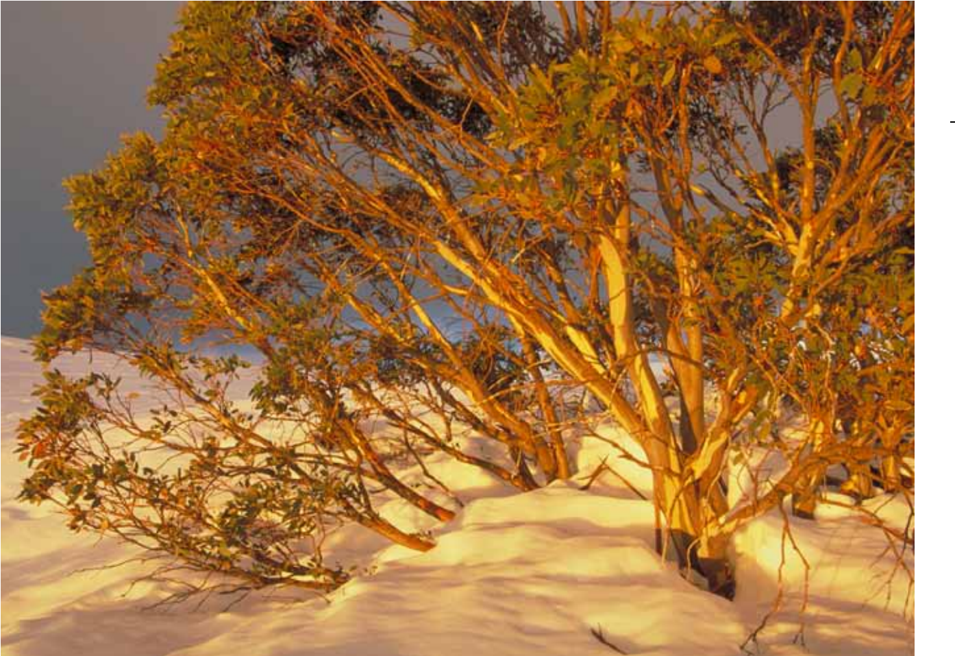
Snow Gum (E. pauciflora) at Lake Mountain.

Finally, we are looking forward to the Trust’s third National Eucalypt Day in March 2016 and presentations from eucalypt experts at the Eucalypt Symposium being held with The Royal Society of Victoria on the 18 March 2016.